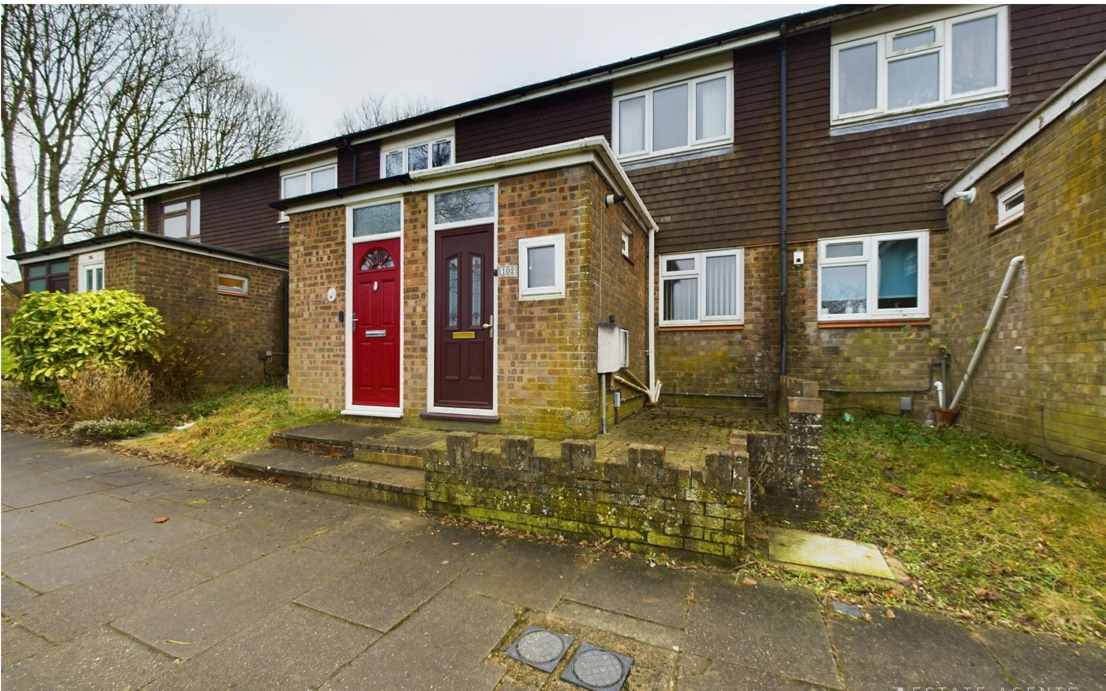
Holbein Close, Black Dam, Basingstoke, RG21 3EX